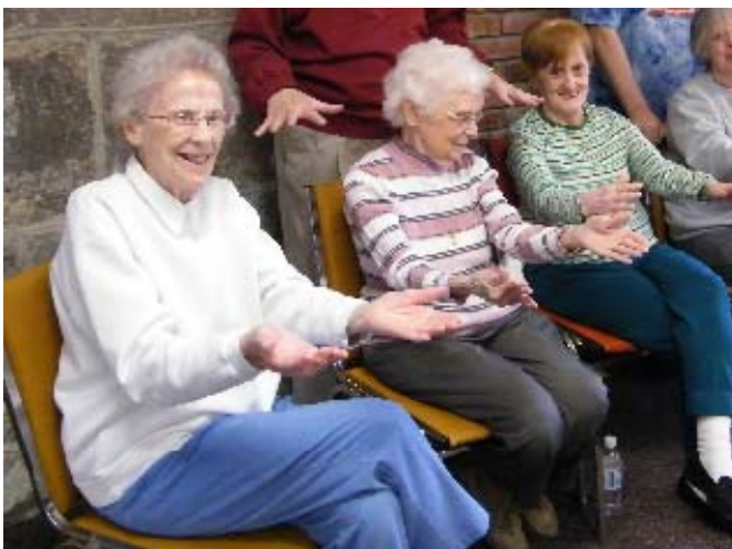
At left, senior participants enjoy some chair exercises that are part of A Matter of Balance Program.