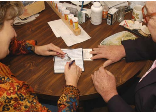
Money Manager Volunteers assist seniors with bill paying and account balancing.

Congregate Meals Served 51,038 Meals-on-Wheels Served 224,289