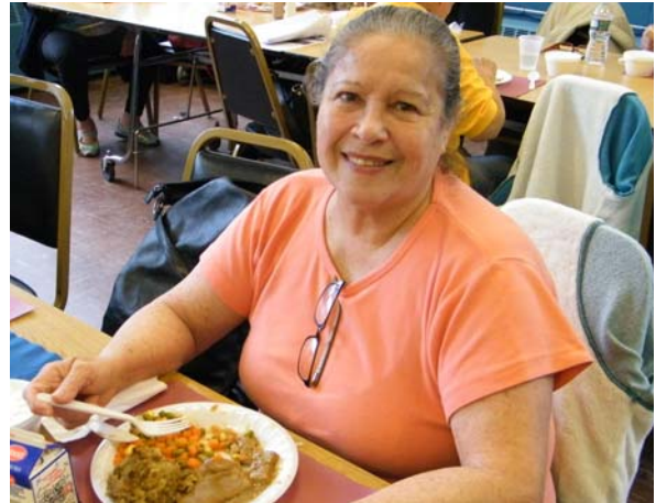
The Nutrition Program provides good nutritious meals for people in the community and at home.

Volunteers, through our Community Support Services Program, provide Companion, Friendly Visitor and Money Management services.