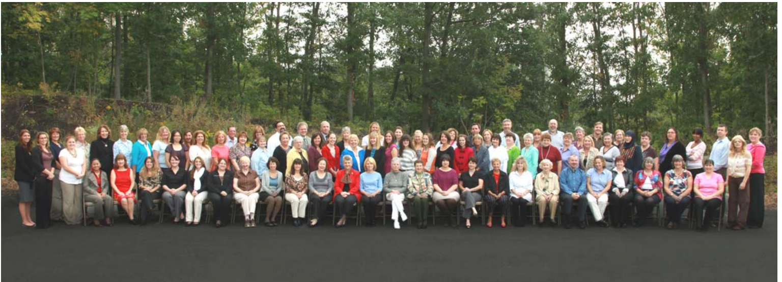
Staff gathered to commemorate Tri-Valley's 35th year of service.