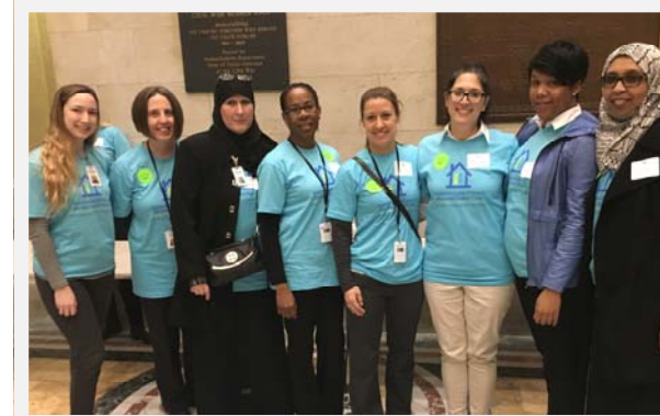
AFC Lobby Day at the State House