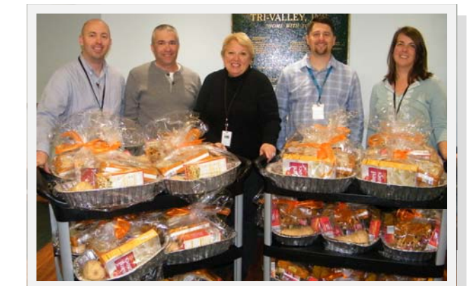
Thanksgiving Baskets from Webster Manor