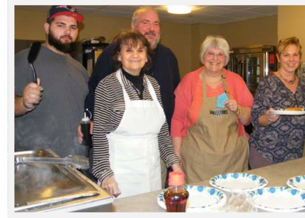
A March for Meals Fundraiser in Webster