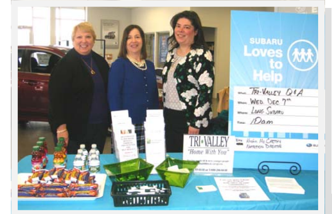
Share the Love Event at Long Subaru