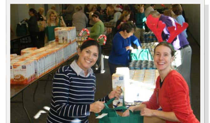
Tri-Valley's 2016 Winter Food Project