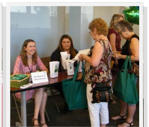
Tri-Valley's First Annual Health and Wellness Fair