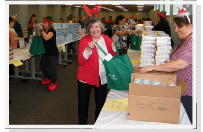
Assembly of food bags for Tri-Valley's 23rd Annual Winter Emergency Food Project