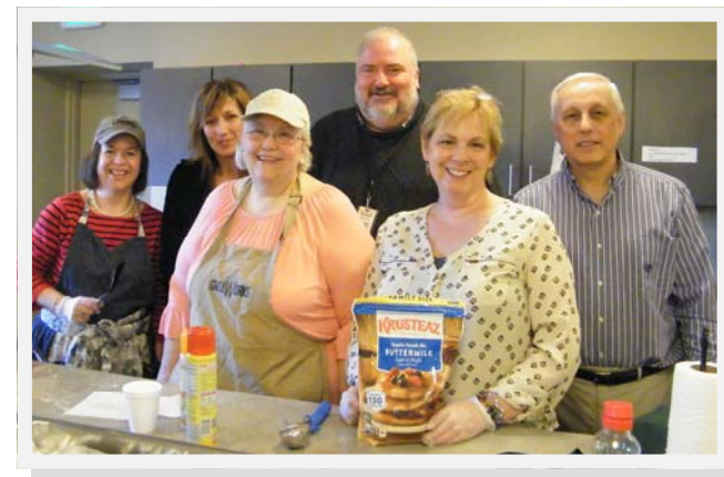
A March for Meals Pancake Breakfast Fundraiser at the Webster Senior Center