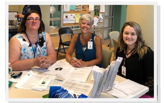
Tri-Valley providing assistance at a FEMA sponsored event following a tornado touchdown in Dudley and Webster