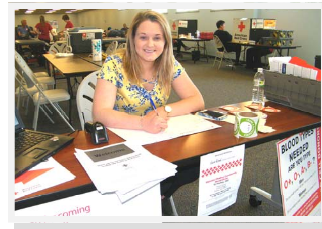
Red Cross Blood Drive for community and staff held at Tri-Valley