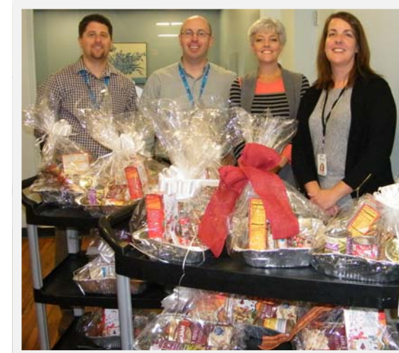
Thanksgiving Baskets from Webster Manor ready for delivery.