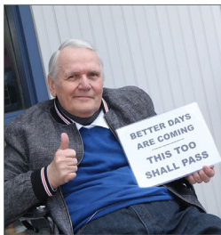
Front Steps Photo Project to benefit Meals on Wheels.