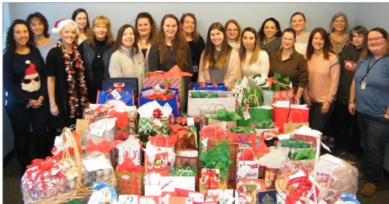
Tri-Valley staff with thankful smiles for the 2019 Terrazza Giving Tree Project that helps so many consumers in need.