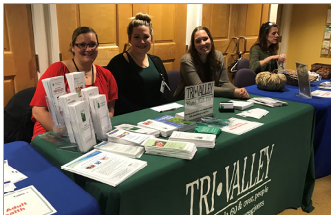
Tri-Valley outreach at Milford Health Fair, Fall 2019.