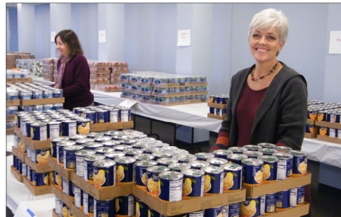
Preparation for Tri-Valley's 2019 Winter Food Project.