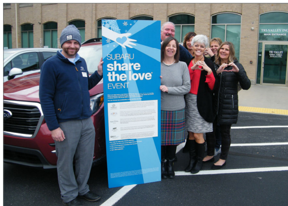
Long Subaru participated in the Subaru Share the Love Event in November 2019 helping to raise funds for Meals on Wheels.