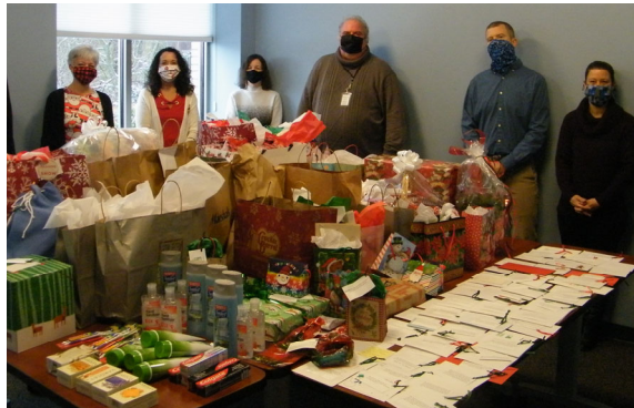
The 2020 Terrazza Giving Tree Project helped many of our neediest consumers