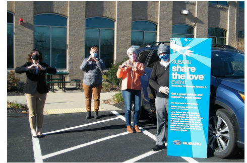
Long Subaru helped raise funds for Meals on Wheels through the Subaru Share the Love Event