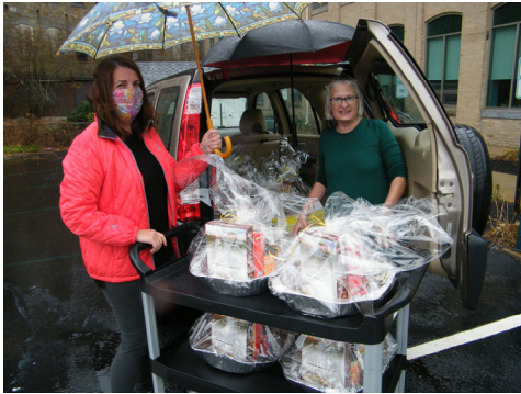
Thanksgiving baskets from Webster Manor