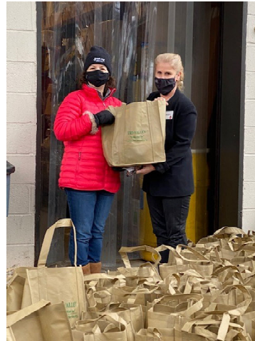
Spencer Community Development Block Grant Food Distribution