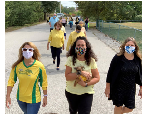
Tri-Valley staff walked to raise awareness of Falls Prevention