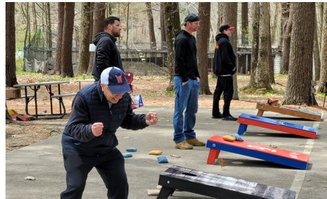
Tri-Valley's Cornhole Tournament