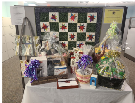
2022 March for Meals raffle prizes