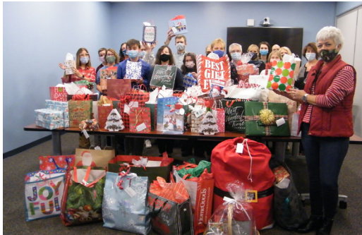
The 2021 Terrazza Giving Tree Project helped many of our neediest consumers