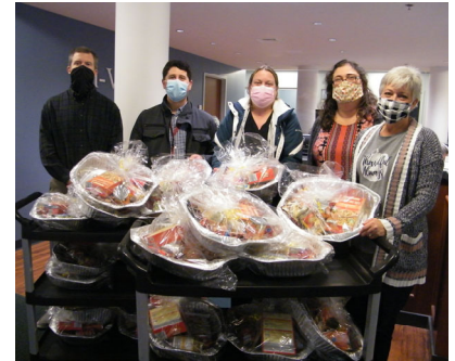
Thanksgiving baskets from Webster Manor