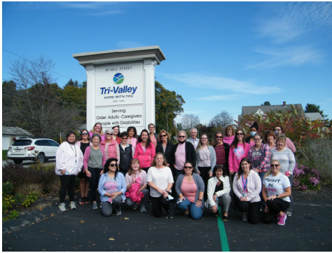
Tri-Valley staff walked to raise awareness of Breast Cancer