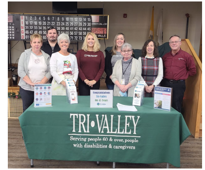
Tri-Valley staff supporting a Soup & Sandwich luncheon at the Spencer Senior Center