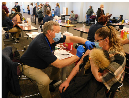
Tri-Valley's Resource Fair and Vaccine Clinic provided 47 community members a covid vaccine and a Cumberland Farms gift card