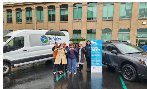
Through Subaru's Share the Love event Tri-Valley partnered with Long Subaru who donates to Meals on Wheels