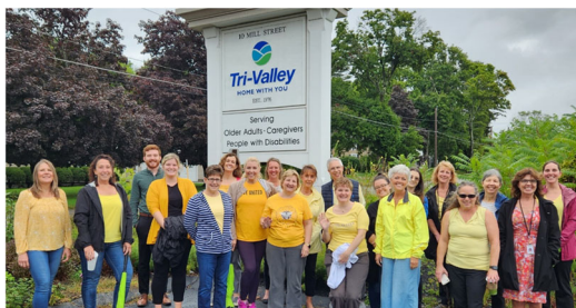
Tri-Valley staff on their annual walk for Falls Prevention Awareness 2022