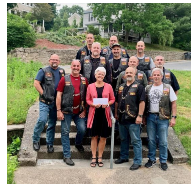
Fire and Iron M/C Station 128 donating to the Winter Food Project