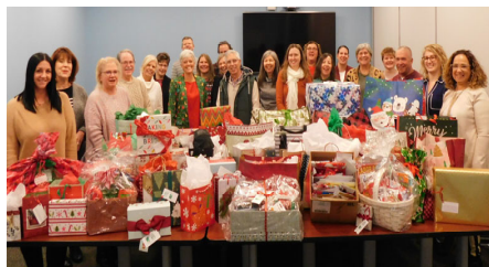
The 2022 Terrazza Giving Tree Project helped many of our neediest consumers