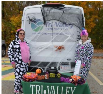
Tri-Valley staff at the North Brookfield Spookfest